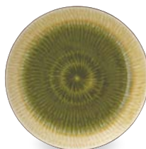
512 67 007 6.0丸皿 D-18 H-2.1 ¥900