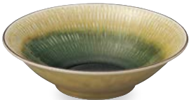
512 67 013 7.5平鉢 D-23 H-6.4 ¥2,100