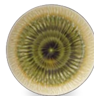
512 67 008 5.0丸皿 D-16 H-2.1 ¥850