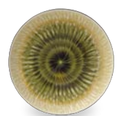
512 67 009 4.5丸皿 D-13.7 H-1.6 ¥700