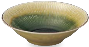
512 67 011 8.5平鉢 D-26.1 H-7.2 ¥2,800