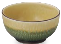
512 67 031 5.5多用井 D-17 H-8.7 ¥1,900