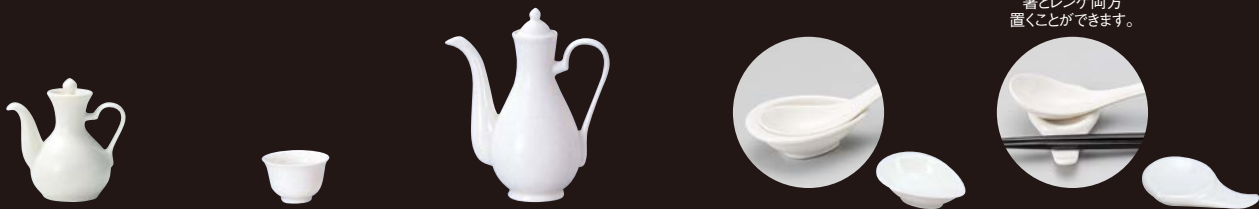
21800387 カスター ¥2,300 L9.4×S6.1×H9.6 90cc OF 21800375 老酒呑 ¥500 D5.9×H3.9・50cc OF 21800371 老酒ポット ¥4,100 L15.6×S8.6×H17.9・400cc OF 21800352 玉レンゲ台(小) ¥680 L9.3×S6.4×H2.7 OF 21800351 兼用レンゲ台 ¥650 L9.3×S5.6×H1.6 OF 箸とレンゲ両方置くことができます。