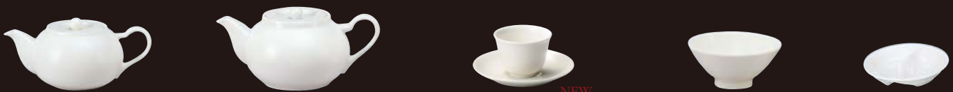
21800365 ティーポット(小) ¥4,000 L19.9×S12.5×H9.4・640cc OF 21800368 ティーポット(大) ¥4,900 L21.9×S14.3×H10.4・905cc OF 21800321 2½"千茶 ¥600 D7.5×H5.4・125cc OF NEW 21800329 茶托 ¥580 D12×H2.1 OF 21800532 5"ライス ¥800 D12.4×H5.9・280cc OF 21800122 丸薬味皿 ¥750 D9.9×H2.0F