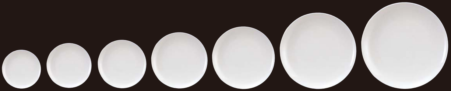
21800070 6½"丸皿 ¥680 D16.4×H2.0F 21800071 7½"丸皿 ¥900 D19.1×H2.1F 21800072 8"丸皿 ¥1,000 D20.7×H2.2F 21800074 9"丸皿 ¥1,300 D23.5×H2.7F 21800075 10"丸皿 ¥2,000 D25.9×H2.7F 21800076 12"丸皿 ¥3,800 D31.3×H3.5F 21800078 14"丸皿 ¥9,800 D35.3×H4.0F